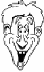
A. AUTHOR1 Organization 1 Place 1