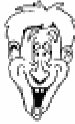
C. AUTHOR3 Organization 3 Place 3