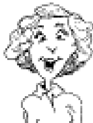
B. AUTHOR2 Organization 2 Place 2