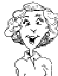
D. AUTHOR4 Organization 4 Place 4